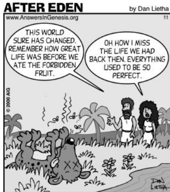
Adam & Eve would often reminisce about the "very good old days."

These books are available at the monthly CSF meeting.