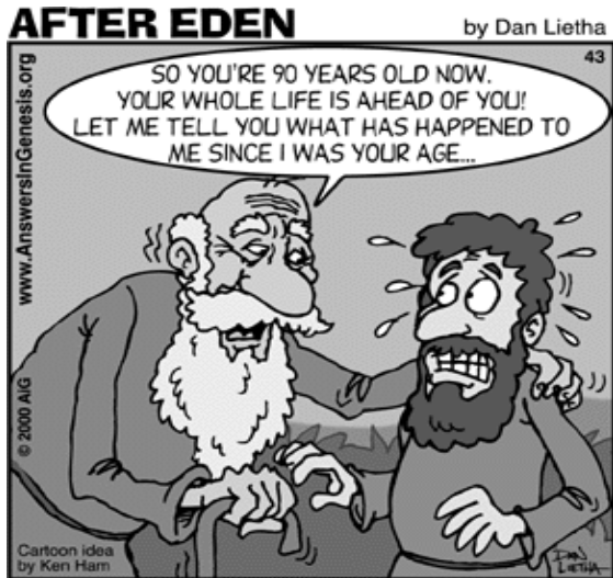
Methuselah’s great grandson Shem knew this was going to take awhile.